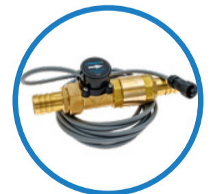
S1-200 Remote Tank Switch with 3m (10ft) Cable - WT602