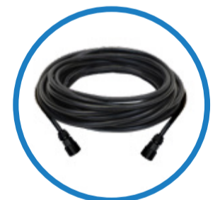
Motor Extension Cable 20m (65ft)