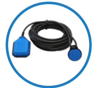
Tank Full Switch 10m (32ft) - WT603