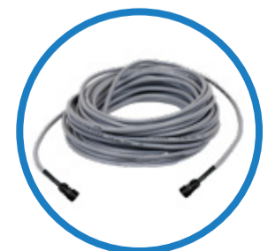
Extension Cable 20m (65ft)