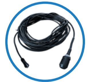
Dry Run Protection Switch 15m (50ft) - WT604