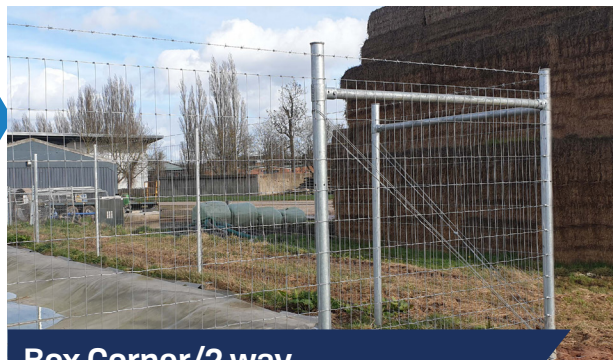
Box Corner/2 way