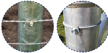
Standard self tap screw to secure barbed or plain wire

The slotted pressure plate has been designed so that it can be retro fitted to the welded strainer plates. By simply slotting the plate prior to installation will give the strainer extra stability and holding. Ideally used when in softer ground or on corner strainers.