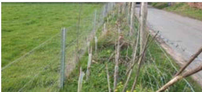
SAPLING PROTECTION, RABBIT FENCING