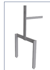
Devils Claw Ground Fixing